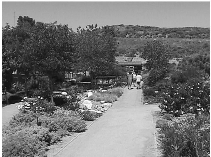
Castaic Lake Water Agency's Conservatory Garden and Learning Center

LACWWDs signed on behalf of the various district service areas in 1996. CLWA signed the urban MOU in February 2001 on behalf of its wholesale service area and pledged to implement several BMPs (listed below) at a wholesale support level. NCWD signed the MOU in 2002 on behalf of its retail service area. VWC signed the MOU in 2006 on behalf of its own retail service area. CLWA and the purveyors coordinate wherever possible to maximize efficiency and ensure the cost effectiveness of their conservation programs.