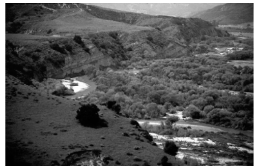
Aerial View of the Upper Santa Clara River Watershed

Efforts include, but are not limited to: land use management plan development; land and habitat conservation plan development; land use designation for conservation; land acquisition for conservation; impact mitigation plan development; endangered species recovery plan development; restoration and enhancement plan development; Sensitive Resource Area designation; SEA planning (County); and the