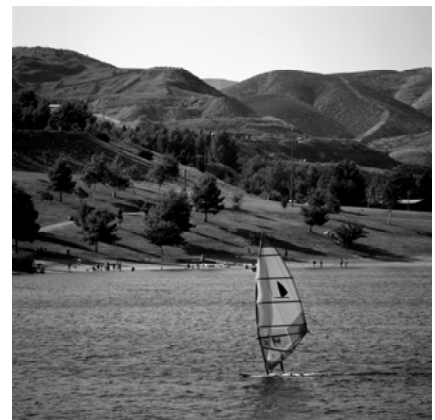
Recreation on Castaic Lake

Water-dependent recreation includes a wide variety of outdoor activities that can be divided into two (2) categories. The first category includes fishing, boating, swimming, and rafting, which occur on lakes, reservoirs, and rivers. The second category includes recreation that is enhanced by water features but does not require actual use of the water, such as wildlife viewing, picnicking, camping, and hiking.