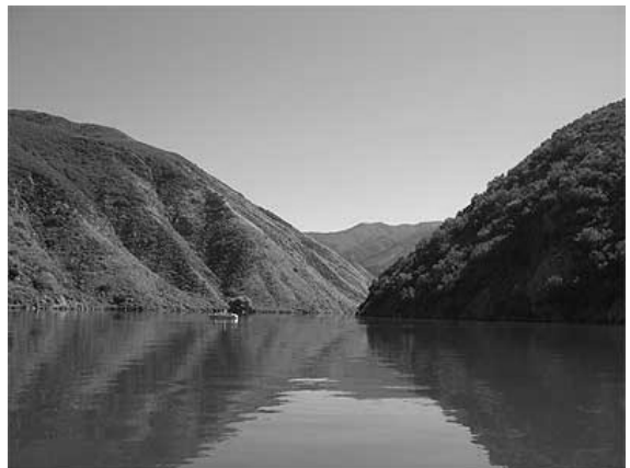
Castaic Lake Stores SWP Water for Treatment

CLWA recently completed a Chloramines Conversion Project. The project involved the system-wide conversion from chlorine disinfection methods to chloramines disinfection techniques. There are multiple benefits from using chloramines instead of chlorine for disinfection of water. Chloramines last longer in water, they are more effective at removing pathogens like bacteria and viruses, and they create fewer by-products (e.g., Trihalomethanes). CLWA converted to chloramines in order to meet drinking water standards as required by the US EPA. This project ensures that the higher water quality standards are met.