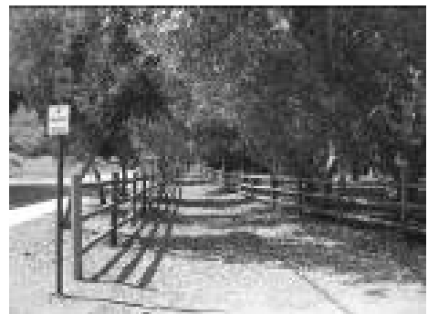
City of Santa Clarita Equestrian and Bike Trail

The Parks and Recreation Element of City of Santa Clarita's General Plan has established the goal of utilizing the Santa Clara River as a central corridor for recreation. Policies proposed to achieve this goal included establishing the Santa Clara River as a major recreational focal point within the Valley, in part