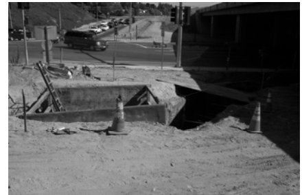
Installation of a conveyance pipeline in the City of Santa Clarita by Castaic Lake Water Agency

Conveyance provides for the movement of water. Specific objectives of natural and managed water conveyance activities include flood management, consumptive and non-consumptive environmental uses, water quality improvement, recreation, operational flexibility, and urban and agricultural water deliveries. Infrastructure includes natural watercourses as well as constructed facilities like canals, pipelines and related structures including pumping plants, diversion structures, distribution systems, and fish screens. Groundwater aquifers are also used to convey water.