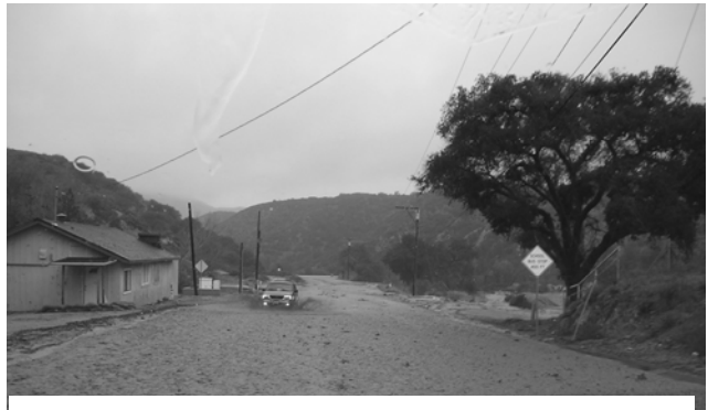
Flooding in the Upper Santa Clara River Region

Floodplain management reduces risks to life and property and benefits natural resources. Floodplain management accepts periodic flooding and generally is a preferred alternative to keeping rivers in their channels and off floodplains. Seasonal inundation of floodplains provides essential habitat for hundreds of species of plants and animals, many of them dependent on periodic floods. There are also benefits to the economy, agriculture, and society to keeping rivers and their floodplains connected, including water quality improvements and groundwater recharge. Floodplain management also entails limiting the amount and type of development in a floodplain.