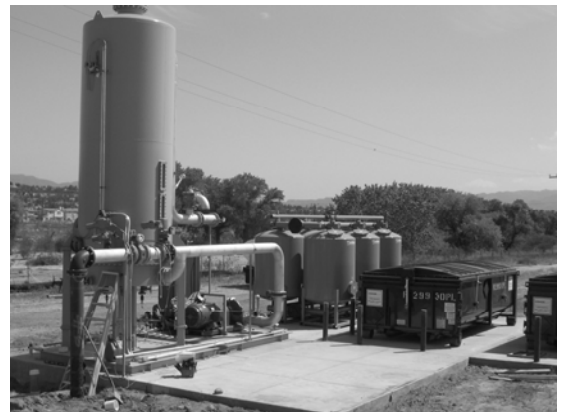
Valencia Water Company Water Softening Demonstration Project

Pollution prevention acts to limit discharges to water that negatively affect beneficial uses. The Los Angeles RWQCB seeks to avoid pollution by regulating discharges from various land uses, industrial uses, septic systems, leaking underground storage tanks, and by controlling dredging. Improving water quality/pollution prevention assists other water management strategies such as “Promote Resource Stewardship.”