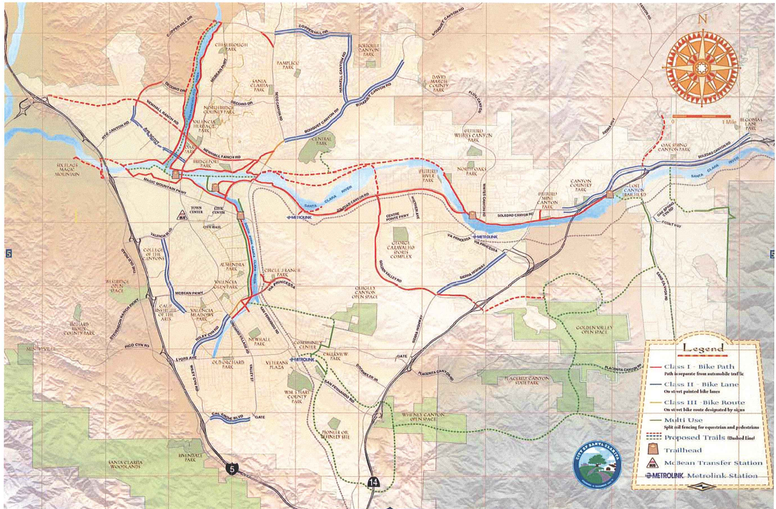
Figure 4.3-1 Upper Santa Clara River IRWMP City of Santa Clarita Trail System